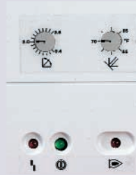
Vitotronic 100, KW10 curve adjustments and indicating lights