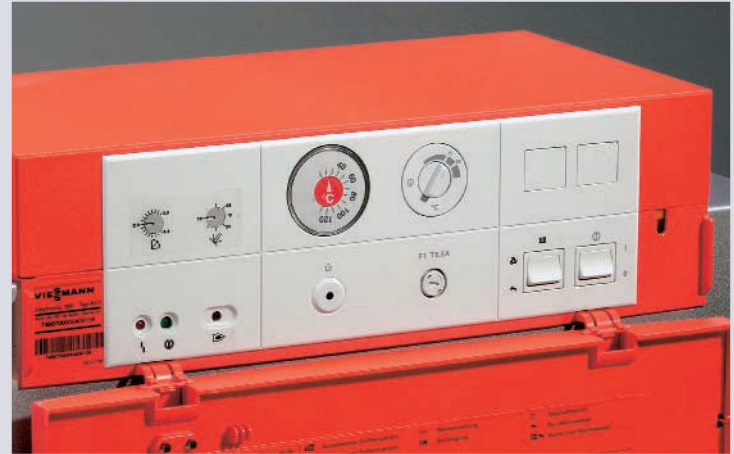
Vitotronic 100, KW10