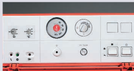
Vitotronic 100, KW10 outdoor reset control