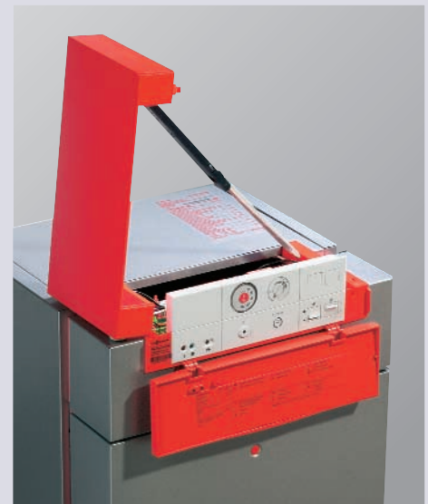
Installation and serviceability made easy