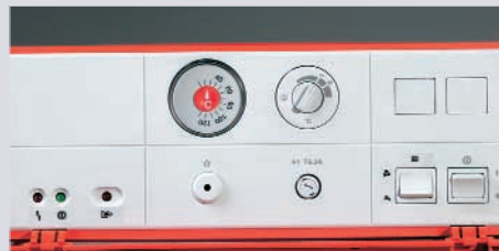
Vitotronic 100, KK10 setpoint control