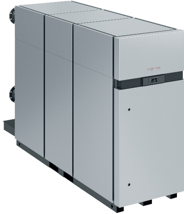
The Vitocrossal 300, CA3B offers gas-fired condensing technology with fully-modulating pre-mix cylinder burner.

▲ The Vitocrossal 300, CA3B takes a bold step forward while retaining the superior Viessmann quality you know and trust. ▲