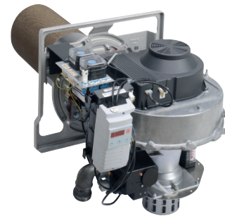
Low-emission fully-modulating pre-mix cylinder burner

Dual fuel is a feature that maintains normal operation in critical care applications, such as nursing homes, hospitals, educational institutions, industrial operations, and more. The Vitocrossal 300, CA3B provides the ability to easily switch from natural gas (NG) to Liquid Propane (LP) at the simple turn of a key (must be pre-ordered) allowing operation to continue without interruption.