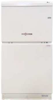
Viessmann AirflowPLUS hydronic air handler