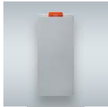
Vitocrossal 300, CU3A