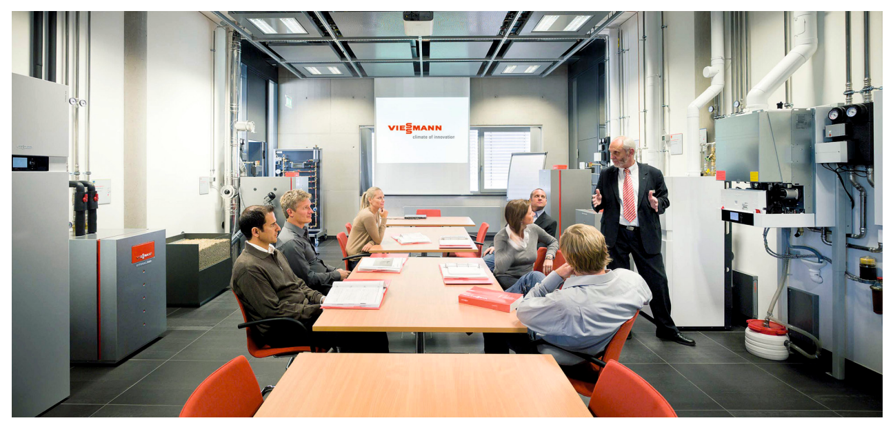
The Viessmann Academy - Your competitive edge

The heating industry is changing. With an increasing demand for high-efficiency heating and renewable energy solutions, it is essential for heating professionals to keep pace with the latest technological advances and current market trends.