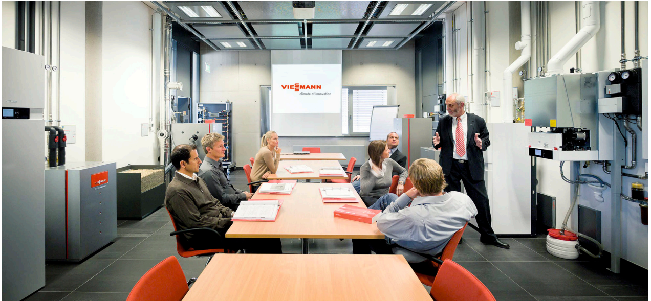
The Viessmann Academy - Your competitive edge

The heating industry is changing. With an increasing demand for high-efficiency heating and renewable energy solutions, it is essential for heating professionals to keep pace with the latest technological advances and current market trends.