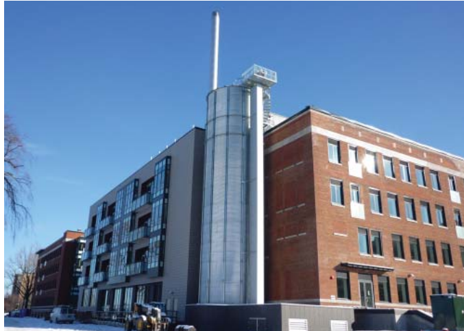
Silo holds 450 m 3 of wood pellets, a six-week reserve during regular winter use

The Pyrotec hot water boilers have met their published performance ratings for combustion efficiency (up to 85%) since the biomass heating system went online in October 2011. When completed, La Cité Verte will use 30% less total energy than conventional developments.