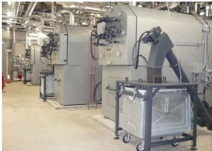
Four Pyrotec KPT-1250 wood-fired boilers provide efficient district space heating and DHW