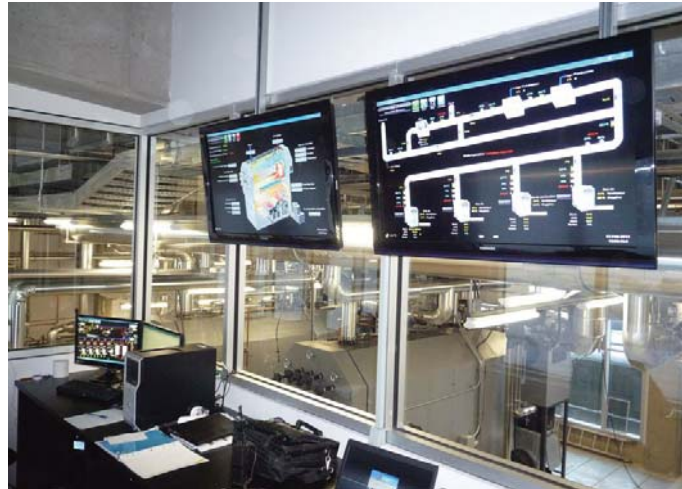
Two screens help illustrate the district heating system to visitors. Right screen: Pyrotec data from Viessmann controls. Left screen: Flue gas and heat exchanger circuits data