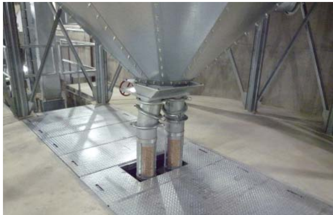
Wood pellet flow into two independent feeding mechanisms for Pyrotec boilers