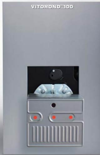
Triple-pass cast iron heat exchanger