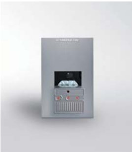
Vitorond 100, VR1 oil-fired cast iron boiler