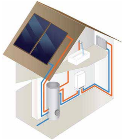
Integrated solar DHW heating system using a Vitocell 100-B dual-coil storage tank