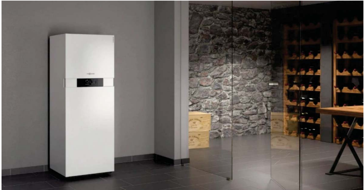
Vitodens 222-F, B2TB combines a 95% efficient (AFUE) boiler with a 26.5 gallon on-demand DHW storage tank.

▲ The most complete residential heating and hot water solution, combining a highly efficient boiler with 26.5 gallon on-demand DHW tank in a compact, single floor-standing unit. ▲