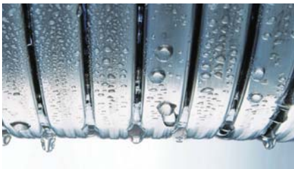
Inox-Radial Heat Exchanger

The Vitodens 222-F, B2TB is equipped with a stainless steel Inox-Radial heat exchanger. Developed and manufactured by Viessmann, this high-quality stainless steel component maximizes performance and reliability. Plus, the self-cleaning heat exchanger contributes to the boiler's long service life and dependable performance.