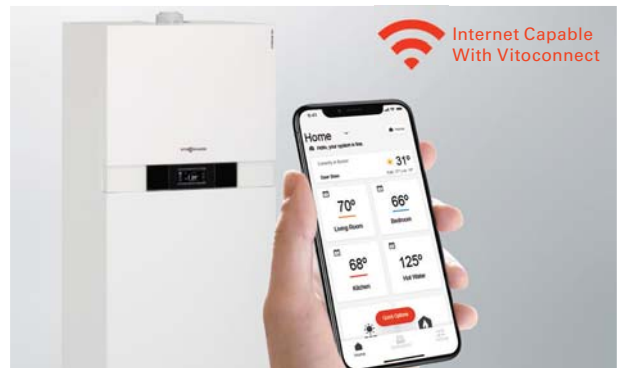
Always be in control with Viessmann's Digital Solutions

You're always in control with the ViCare App. As part of Viessmann's Digital Solutions, ViCare allows you to remotely control your Vitodens 222-F, B2TB, anywhere from your smartphone or tablet (when used with Vitoconnect). Learn more at https://www.viessmann.ca/en/services/viessmann-apps/vitoconnect.html