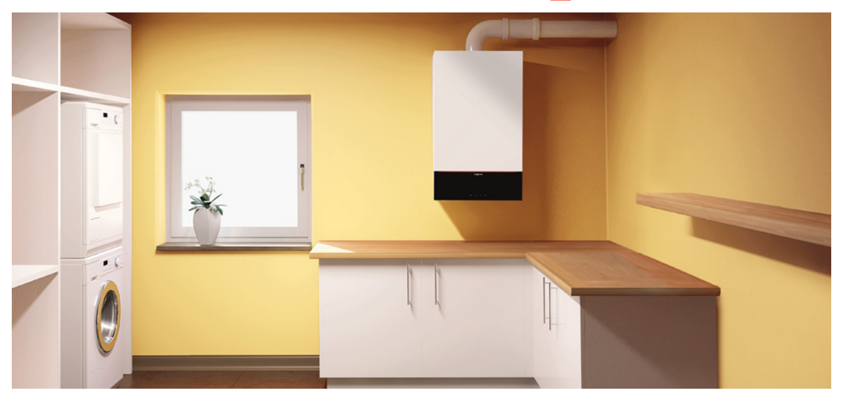
The Vitodens 100-W offers a reliable, compact solution for heating and on-demand domestic hot water (B1KE)

The new Vitodens: Peace of mind through future-proof design. The perfect combination of value, quality and Viessmann technology.