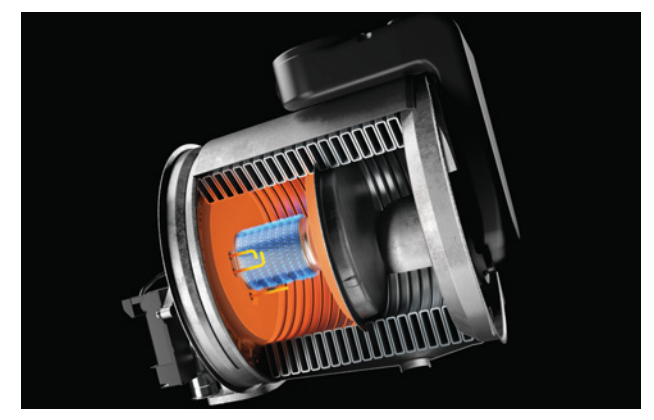
Low-emission, Viessmann-made MatriX Plus cylinder burner

The proprietary Viessmann modulating Lambda Pro Plus combustion control offers clean combustion, 10:1 turn down ratio and quiet operation with either propane or natural gas, which can be changed at the push of a button.