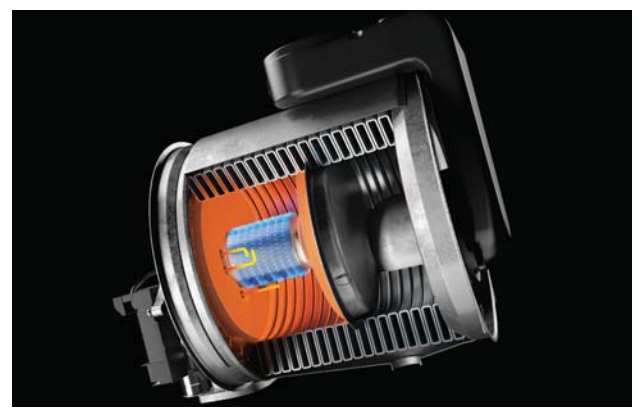
Low-emission, Viessmann-made MatriXPlus burner

The Viessmann-made modulating MatriXPlus cylinder burner offers extremely clean combustion with up to a 14:1 turndown ratio, and meets Low NOx requirements.