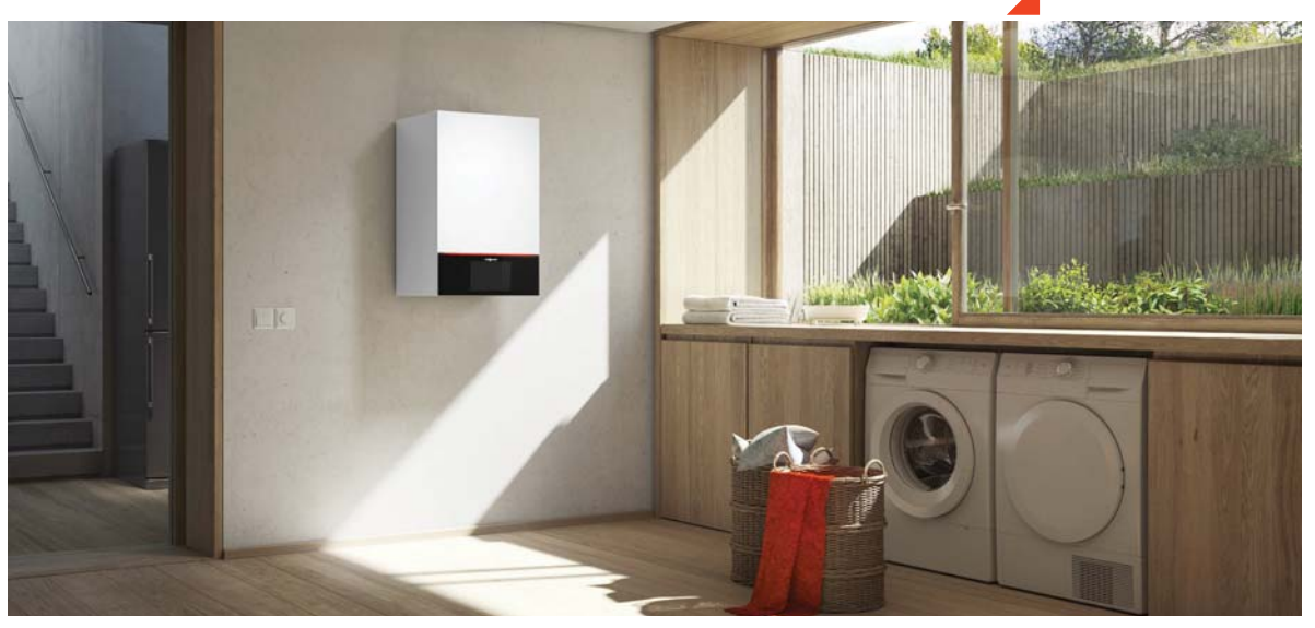
The Vitodens 200-W offers the best value in its class with new industry-leading technology and the most standard features

With the industry's first intelligent combustion management system, the new Vitodens 200 offers the highest levels of performance, reliability, and comfort