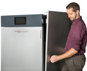
Enclosure panels are easily removed for direct access to all componentry