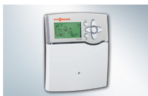
SCU 345 Solar System Control.