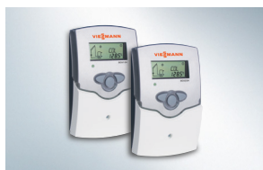
SCU 124/SCU 224 Solar System Control.

V40 Flowmeter Kit includes two sensors and two sensor wells. For use with SCU 345 or SEM.