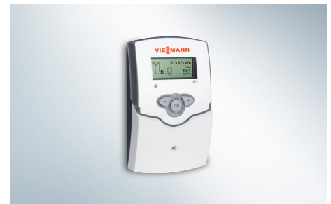
Solar Energy Meter

With input from the V40 Flowmeter and two system sensors, the Solar Energy Meter (SEM) records the energy yield and flowrate produced by your solar system. Heat quality calculations displayed on the large screen are also stored in the internal memory or transmitted to the Datalogger or computer using VBus communication.