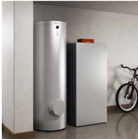
Vitocell 100-V single-coil DHW storage tank