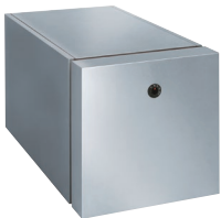
Vitocell-H 300 Compact and "stackable"