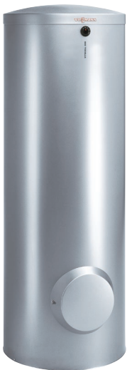
Vitocell-V 300 Convenient, durable, hygienic