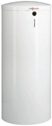
Vitocell 300-W, EVIA New smaller size and colour to match wall-mounted boilers